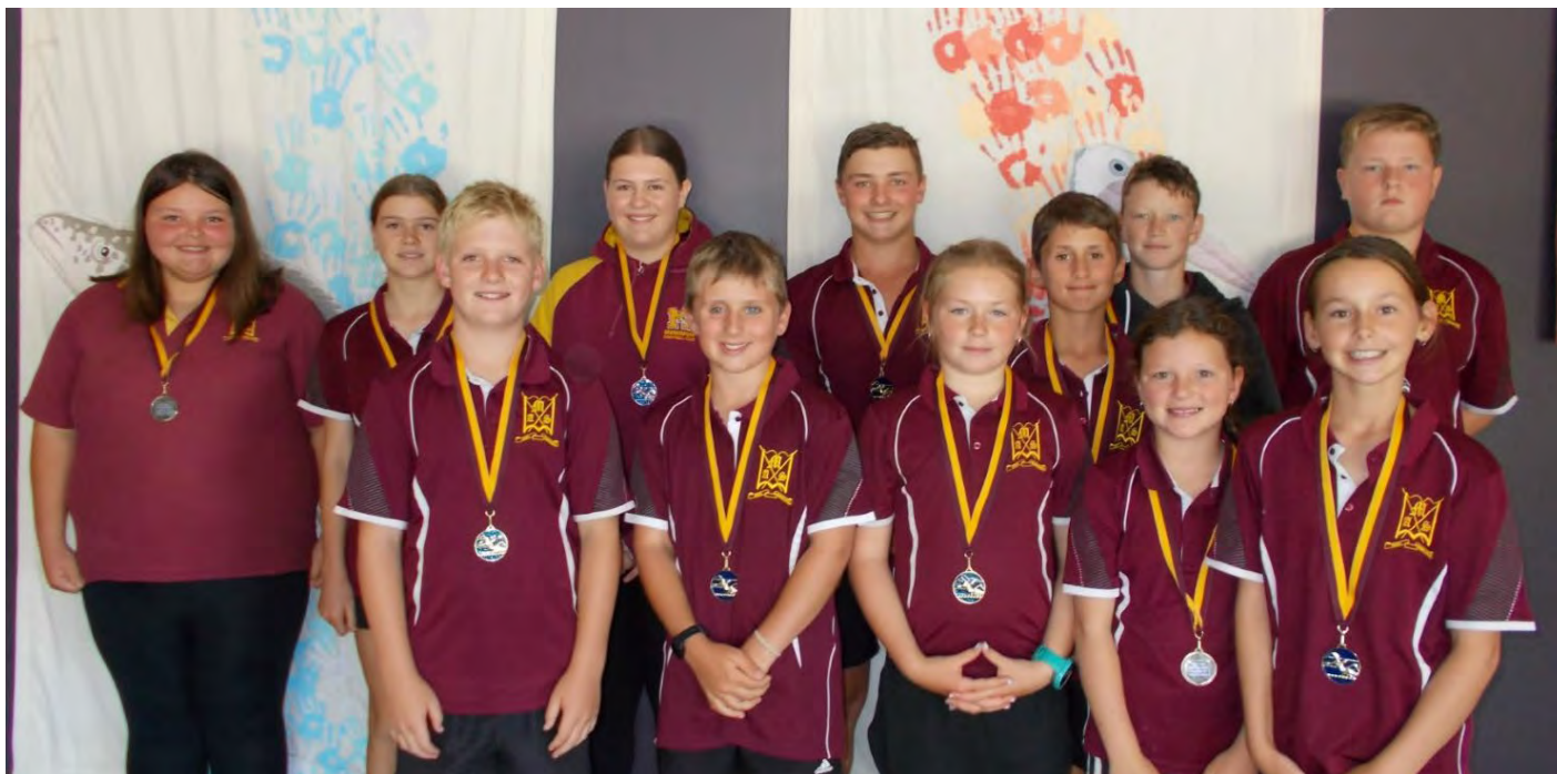
Team Winner - Kungari 594 points