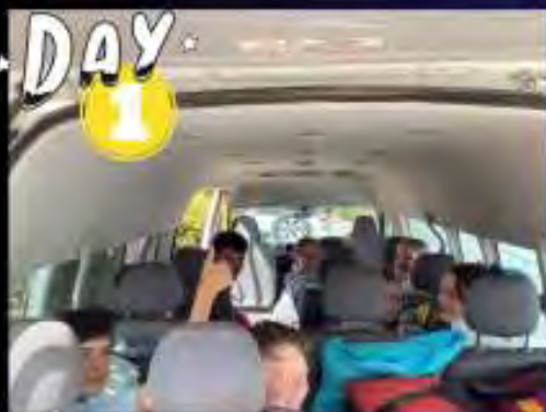
All packed and ready to go!