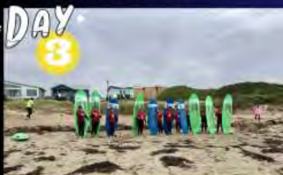
Surfing at Middleton