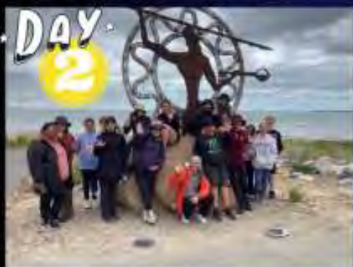
Granite Island Walk