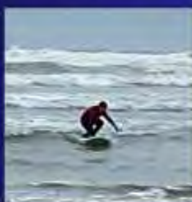
Body Boarding at Horeshoe Bay