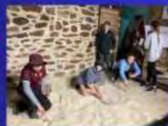
Searching for fossils at the Whale Museum