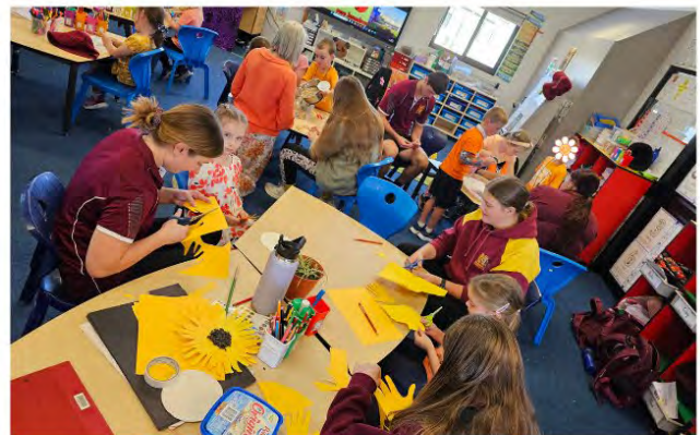
They did a great job making playdough, colouring ins, beading, sunflowers and sensory chickpeas for us!