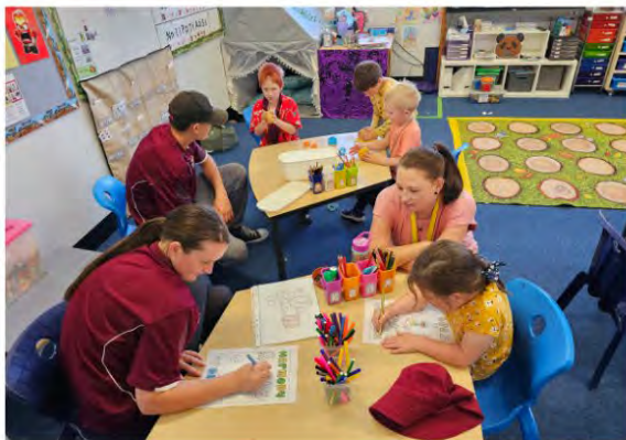
We had a great time on Harmony Day using the creations our Year 10/11/12 buddies made for us!