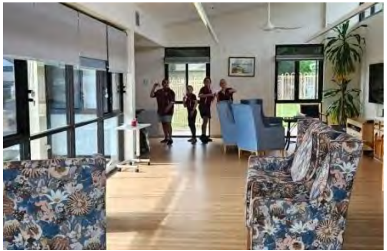
Student paper plane competition in new NO:RI living room at Jallarah