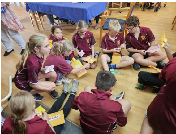
Students receiving gifts from their Jallarah Friends