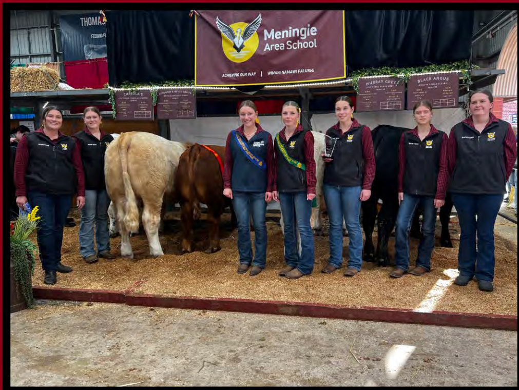
The team celebrated their success at the end of the Led Steer Competition!