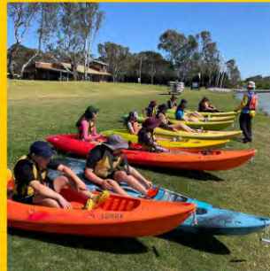
Canoeing Set Up