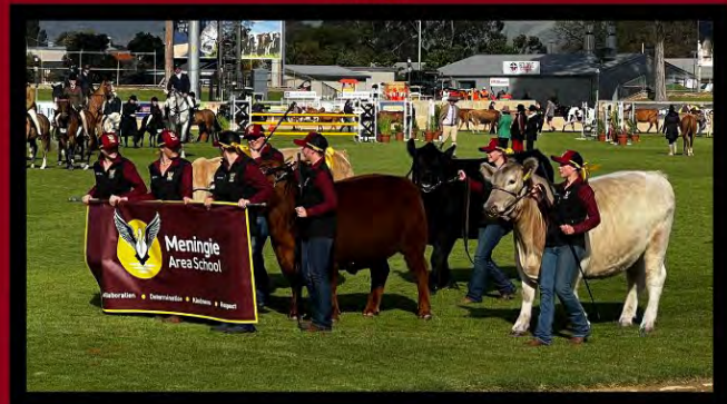
Led Steer Grand Parade