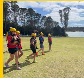
Ready to go!