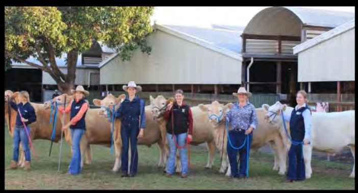
Caithness Charolais Uberto was selected as part of the TFI Charolais Team