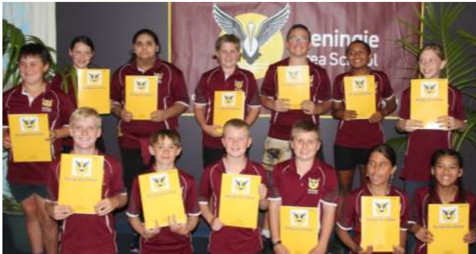
2024 Year 6 Class