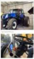
Swan Farm Machinery

Students visited Swan Farm Machinery to learn about the latest agricultural equipment. They saw a variety of tractors and implements used in farming, including a blue tractor with a front loader and a rear-mounted implement. The staff explained how these machines are used to increase efficiency in agricultural operations.