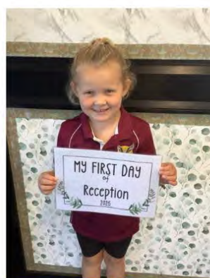
Mack- making with my friends